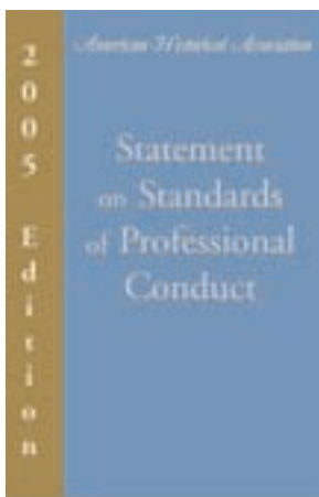
A new, completely revised edition of the AHA's Statement on Standards of Professional Conduct was published in 2005.

Anthony Grafton (Princeton University) is the vice president of the Professional Division.